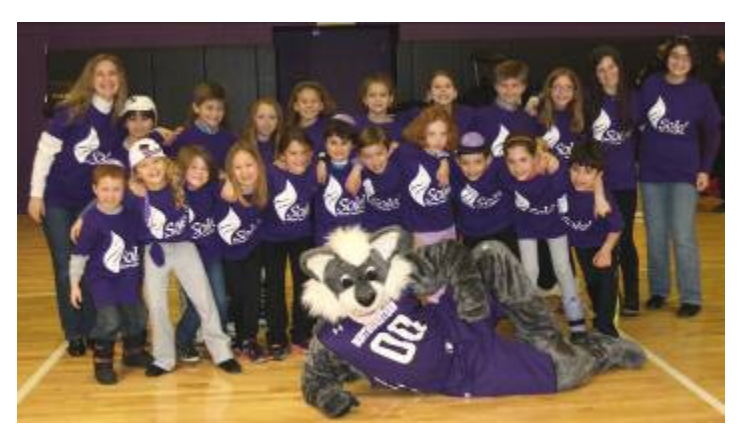
Solel's Youth Choir with Willy the Wildcat